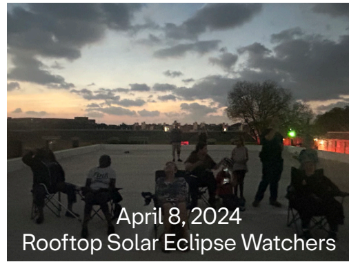
April 8, 2024 Rooftop Solar Eclipse Watchers